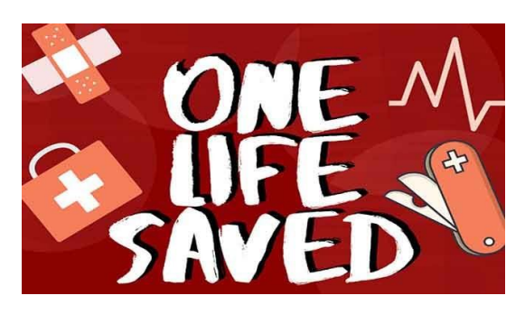
10 February - 11 May 2020

While Singapore is touted as a "City In A Garden", many people may not fully appreciate its biodiversity. Participants will embark on an immersive guided nature walk to uncover the natural treasures. Find out more.