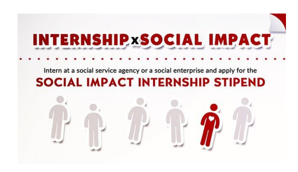
Now - 30 April 2020