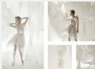
Illuminating Paper Dresses