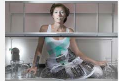
Scentsory Chameleon Bodysuits